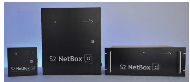
Several enclosure options are available for S2 NetBox systems.

Software for the entire system is embedded in the network controller. Updates are delivered online and completed in a single operation. Data storage is provided in flash ROM, removable compact flash, disk,